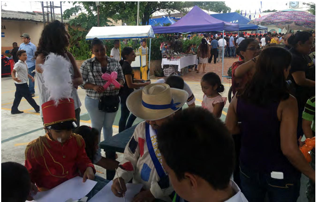
Our team at Radio Cadena Mi Gente (top). Festival on water and peace in San Isidro (bottom).

During the trip, our team also met with different actor groups in San Isidro (e.g., representatives of the local police, business leaders, government officials, community members, and MUFRAS-32 members). The highlight of the team's visit was a water festival coinciding with El Salvador's Independence Day and organized by MUFRAS-32, PPP's local collaborator. Issues around peaceful management of local waters were raised during the festival. The festival also coincided with the finalization of the constitution of the comisión, the group of local actors who committed to promoting peace in water management during the project launch in June 2016.