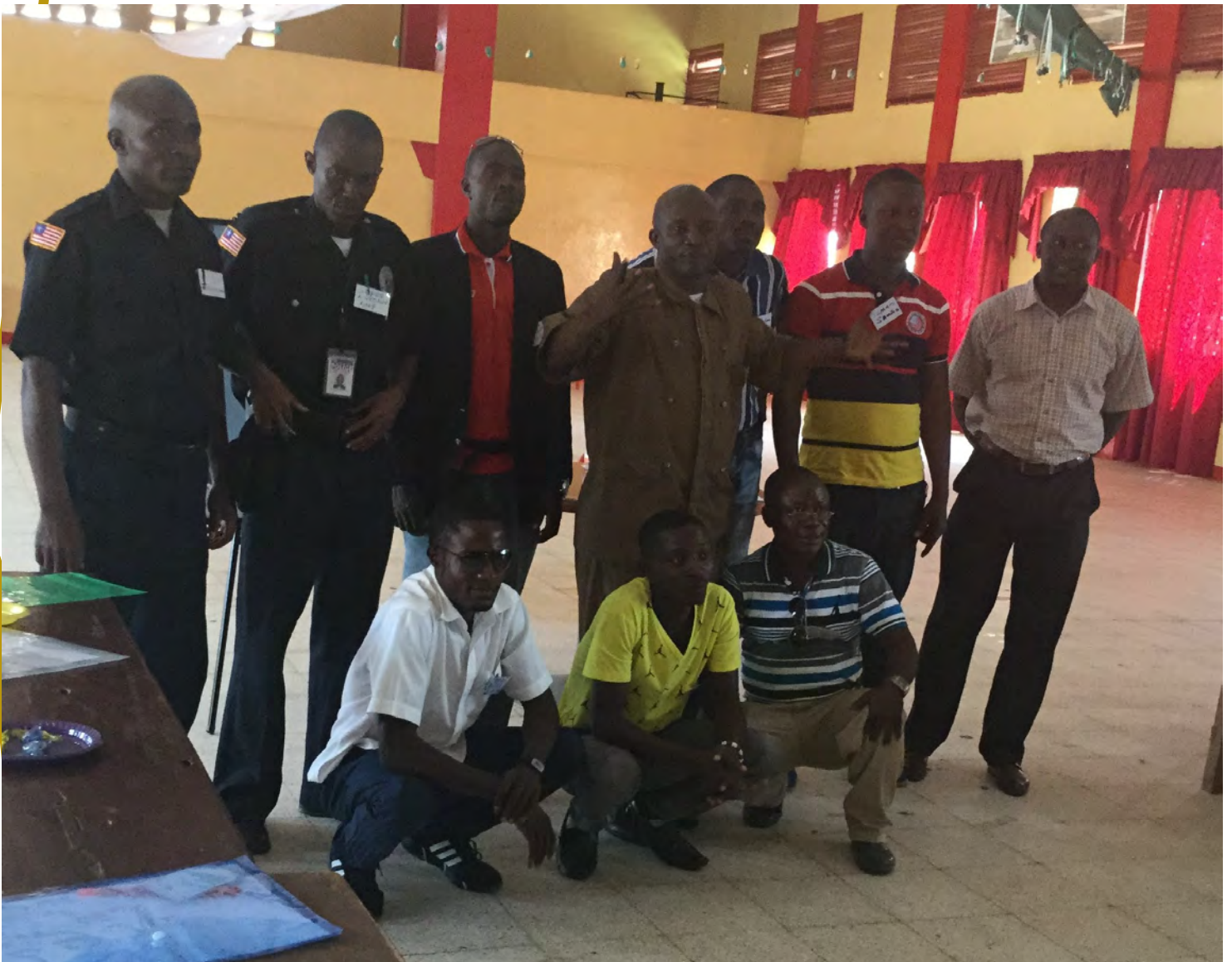
Snapshot of working group organized after the actor meeting in Bong County, September 2016.

PPPN is currently working with the local citizens in Bong County to strategize best ways to spread the word on peace and to encourage collaboration among various actor groups in the local communities in Bong in their joint efforts against electoral violence in 2017 and beyond. The project is to be launched in January 2017.