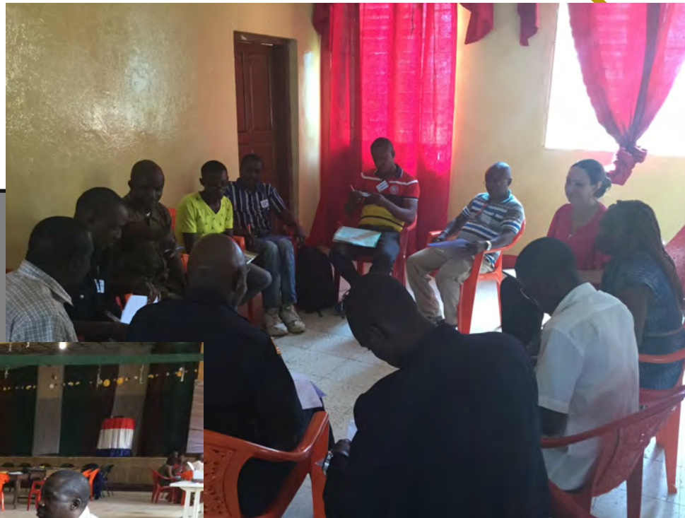
Actor meeting activities in Bong County, September 2016.