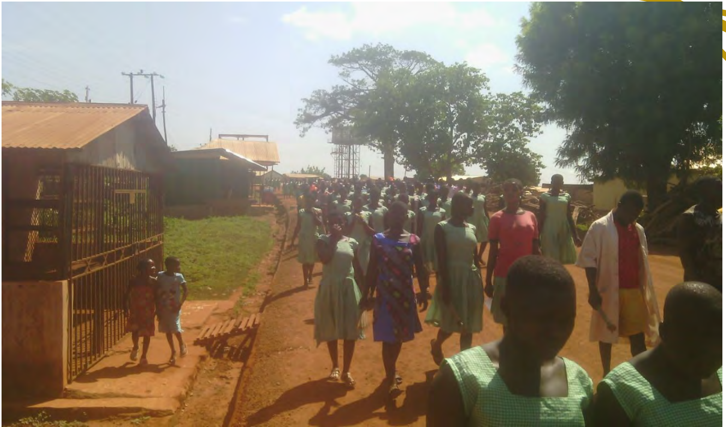
First peace walk organized by NYPAD in June 2016 in Nandom, Ghana.

In August 2016, NYPAD organized a town hall meeting, which included 70 community members, local leaders, and politicians. The town hall meeting aimed to encourage peaceful campaigning. Post-meeting evaluations suggest participants are committed to preaching peace and educating others before, during and after the election.